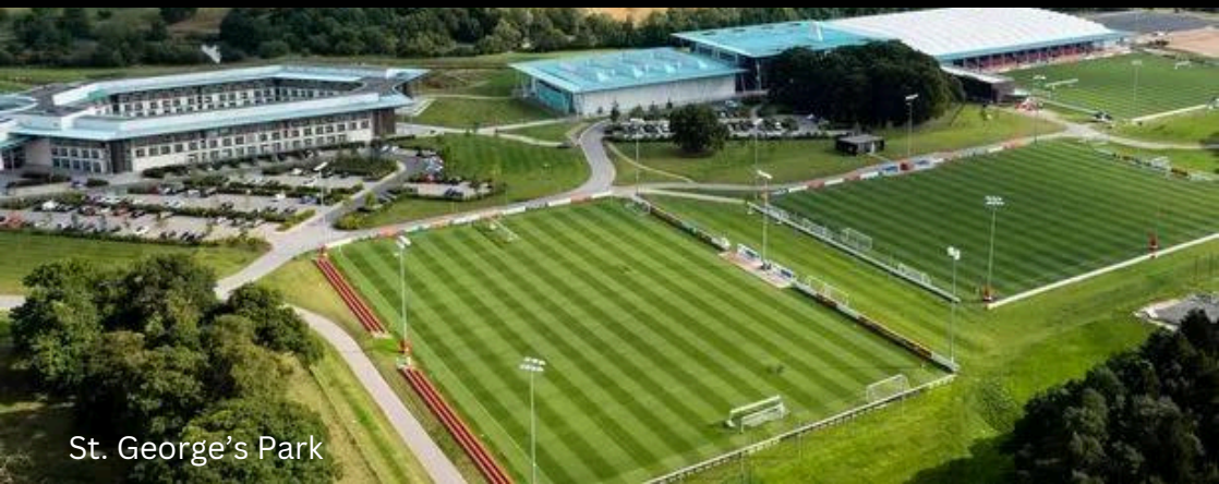
St. George's Park

This tour will not just provide an invaluable experience for motivated and passionate goalkeepers, it will change the way they think, train, play and attack their dreams on their return.