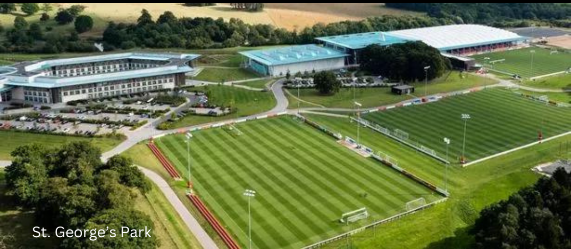
St. George's Park

This tour will not just provide an invaluable experience for motivated and passionate goalkeepers, it will change the way they think, train, play and attack their dreams on their return.